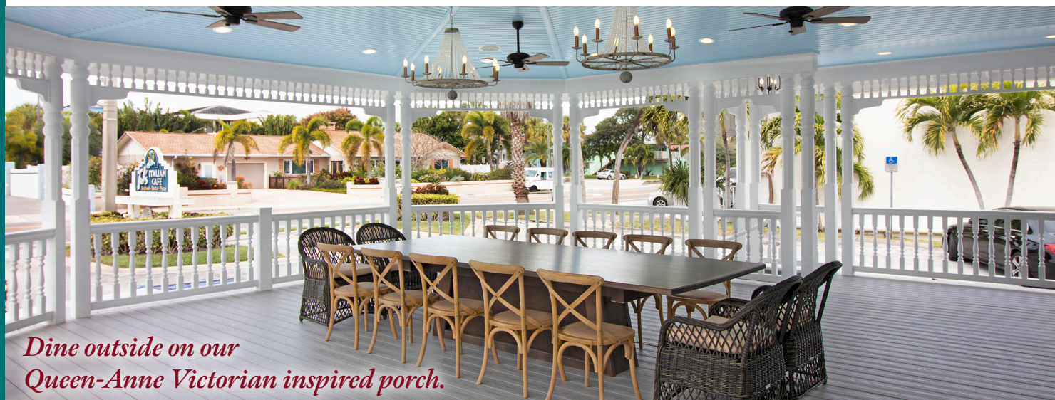
Dine outside on our Queen-Anne Victorian inspired porch.